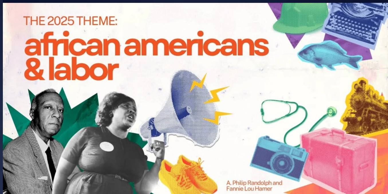
A. Philip Randolph and Fannie Lou Hamer